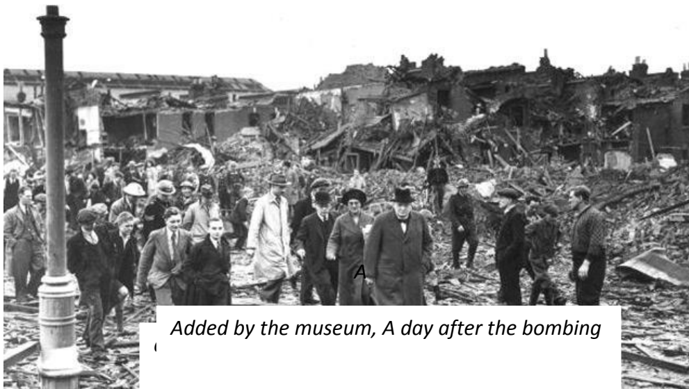
Added by the museum, A day after the bombing

famous guards in front of the Palace. I think I will enjoy it because it's funny to make a face to them when they are not allowed to laugh. Okay now I'm a little scared. We heard planes again but this time it was more intense. A