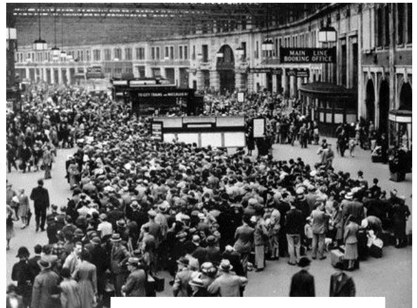
Our arrival in London

It's the second day of our trip to England. Today was a very exciting day, because it was the first time I had been to London. We visited the British museum where I saw a lot of interesting things. Now it's the evening and I have to go eat my dinner so I'm going to stop writing. Tomorrow will be our second day in London and we will visit all the famous places of the city. Goodbye!